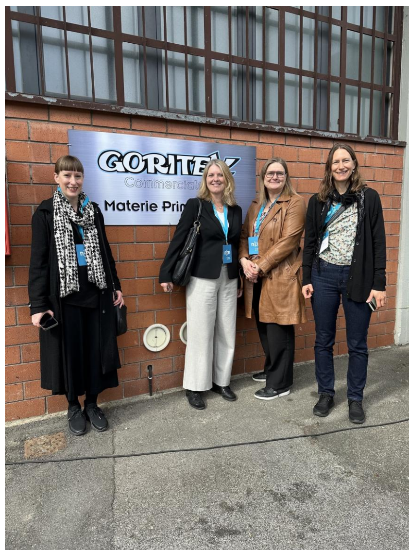
OSLO METROPOLITAN UNIVERSITY STORBYUNIVERSITETET