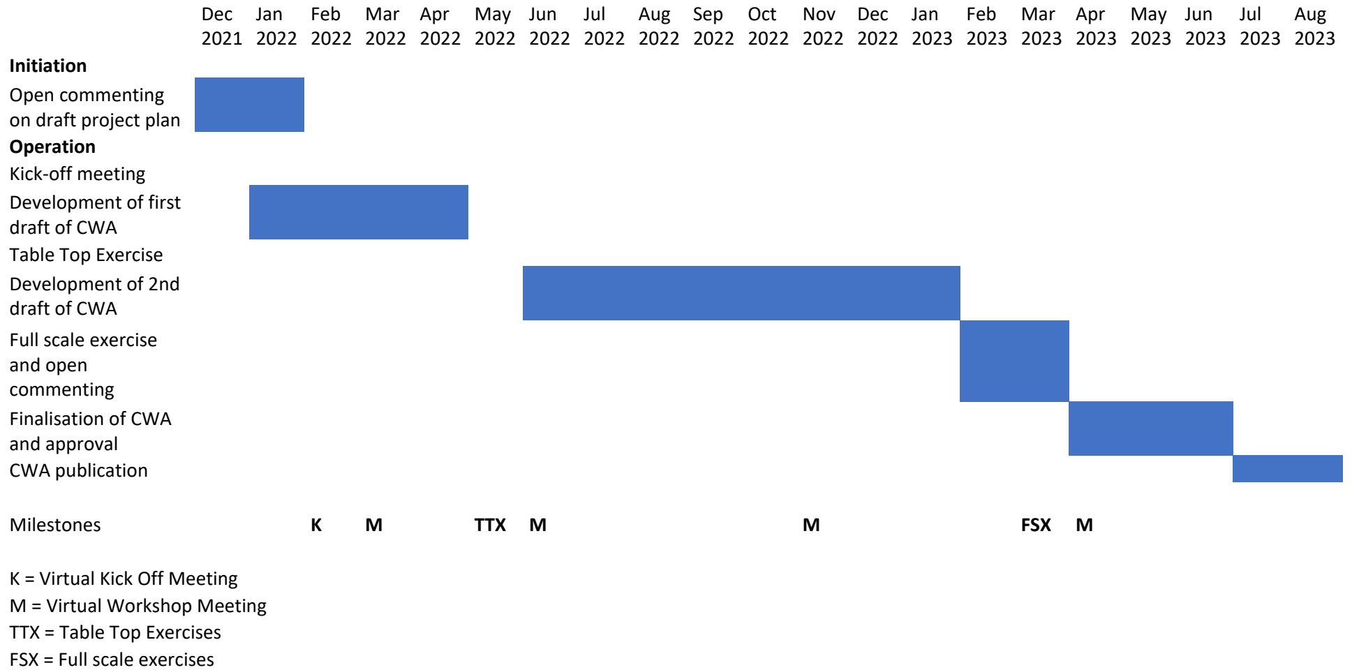
Table 1: Workshop schedule (preliminary)